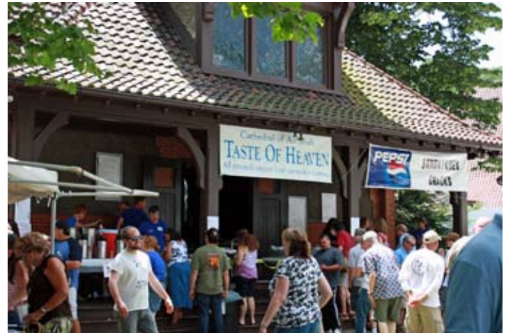
Cathedral Food Booth at the Village Art and Craft Fair