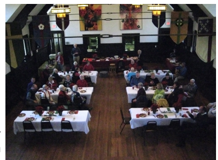
The Volunteer Luncheon