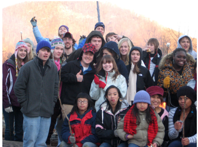
At the EYC Epiphany Bonfire at Camp Rockmont

Middle School Mission trip to Youthworks! site in Birmingham AL! Week of July 25th!