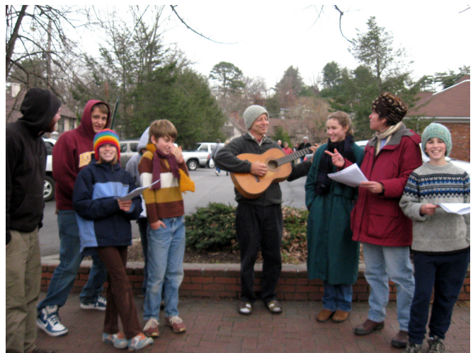
EYC Caroling in Biltmore Village